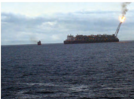
The Chevron Agbami is a floating production, storage and offloading (FPSO) vessel stationed in Nigeria

Satellite communications are subject to frequent service disruptions caused by interference due to bad weather. To restore service, Schlumberger's operational staff often has to reconfigure and re-provision devices, such as satellites, antenna controllers and other communications equipment. This manual